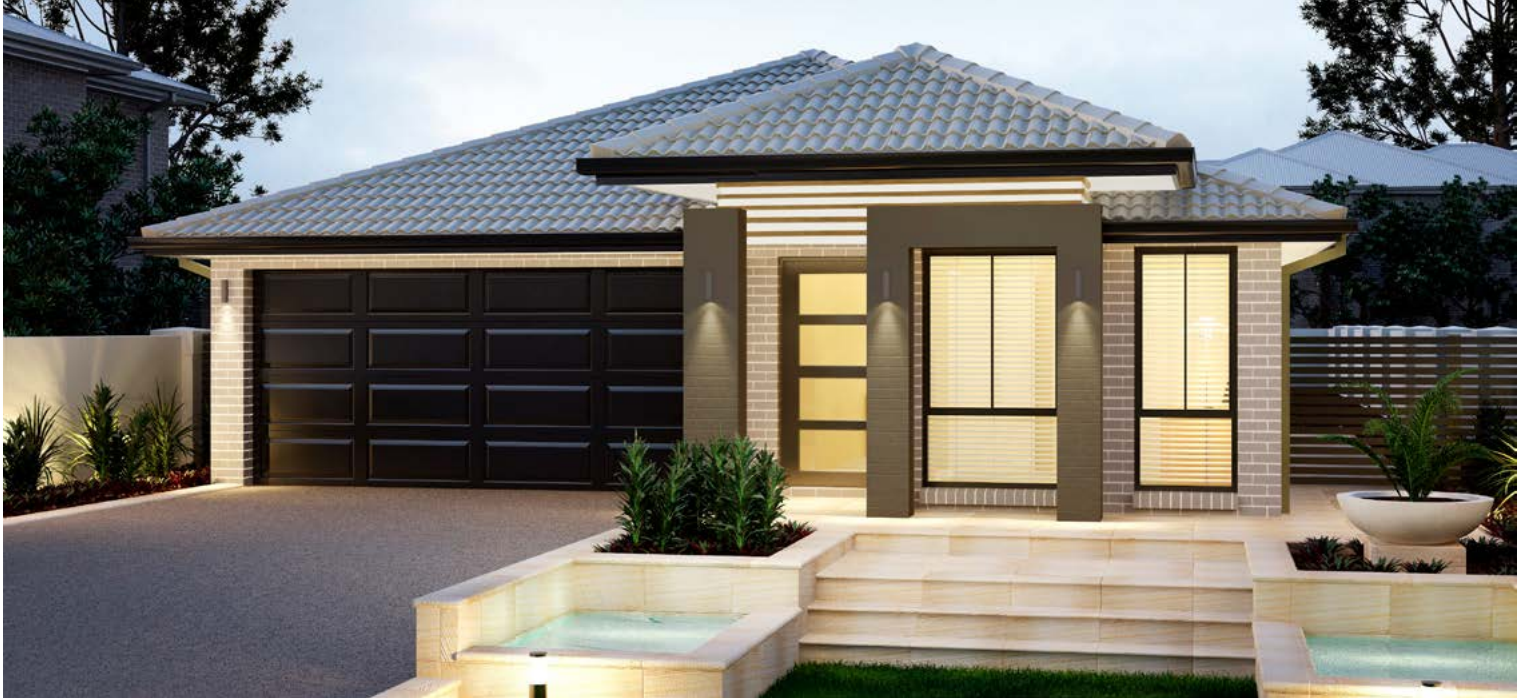
ARTIST IMPRESSION ONLY. STRATTON FAÇADE AS ILLUSTRATED.