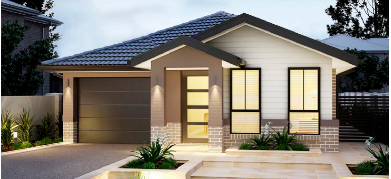
ARTIST IMPRESSION ONLY. TRADITIONAL FAÇADE AS ILLUSTRATED.