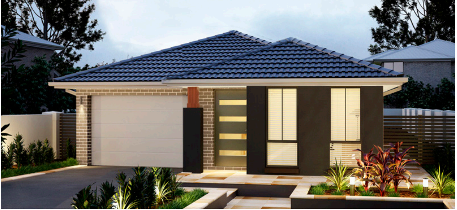
ARTIST IMPRESSION ONLY. CAPRI FAÇADE AS ILLUSTRATED.