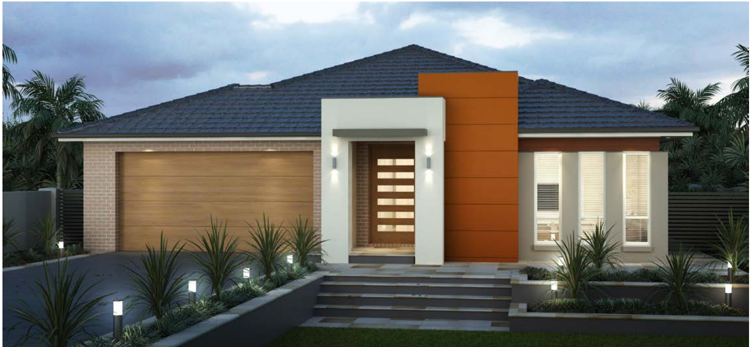
ARTIST IMPRESSION ONLY. YARRA FAÇADE AS ILLUSTRATED.